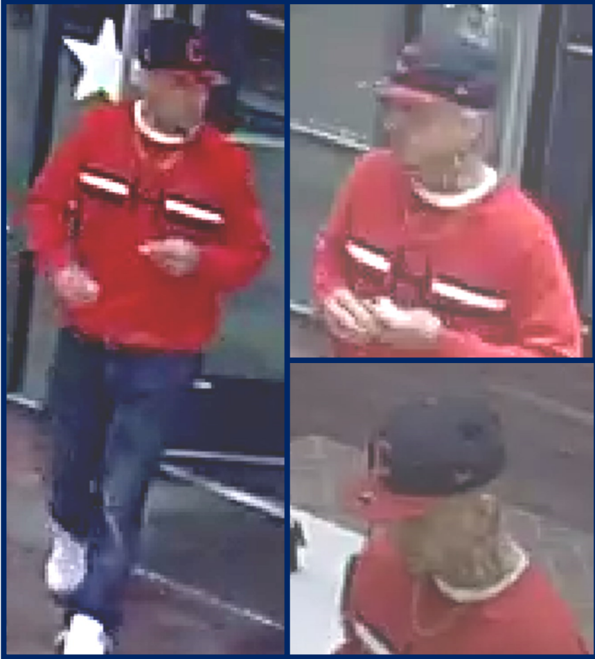
Suspect # 1